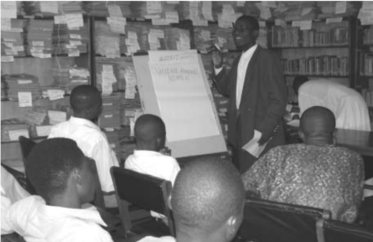
Many boys still blame the rape victim and have difficulties understanding or condemning marital rape.