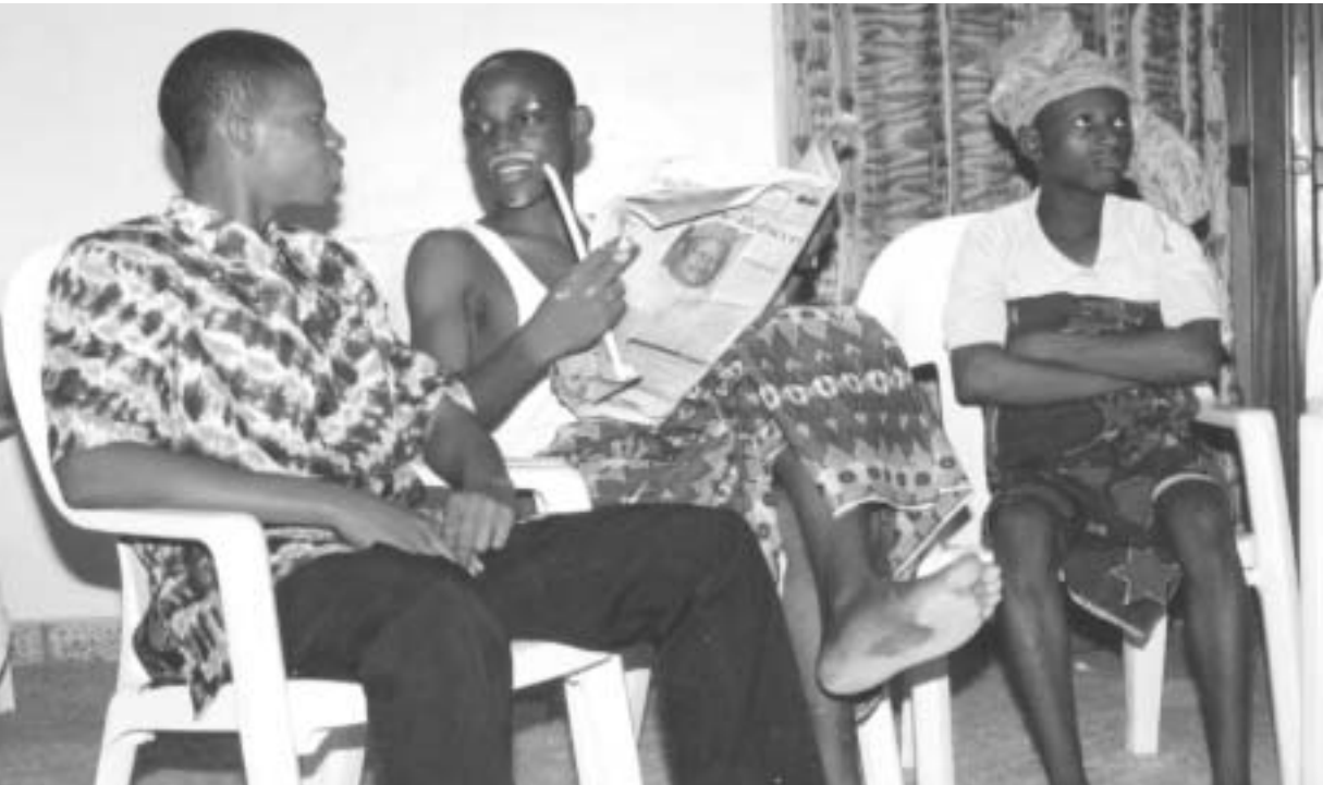
In a skit on marriage customs, the boys critiqued certain aspects of traditional Nigerian culture, such as brideprice, while also showing great fondness for many other aspects of their culture, such as its trove of proverbs.