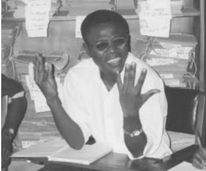
Field officers end discussions about rape by encouraging the boys to brainstorm about ways to address sexual violence.

I observed the graduation ceremony for CMA participants from Hope Waddell Training Institute and West African Peoples' Institute, two secondary schools in Calabar where CMA is active. The program consisted of a dialogic discussion on rape, and a skit on forced marriage and brideprice. The approach proved intriguing.