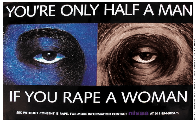
Figure 2: South African poster aimed at changing attitudes

Social support is another source of power for women. In studies from several countries, good social support was shown possibly to be protective against intimate partner violence. 9,12 Temporal issues need clarification as abusive men often restrict their partner's movement and contact with others, and so abused women become isolated. This isolation is compounded by the effects of abuse on women's mental state, which can result in them withdrawing into themselves, and also by problems of compassion fatigue in those who are asked to play a supportive part. 44 Social support during relationship problems has also been associated with increased risk of violence, but it seems likely that the explanation is that some women are more likely to discuss relationship problems when these become more severe. 7 Notwithstanding this factor, social support, especially from a woman's family, may indicate that she is valued, enhance her self-esteem, and be a source of practical assistance during violent experiences or afterwards. 12 Anthropological research indicates that in settings where women are valued in their own right, 42 and the social position