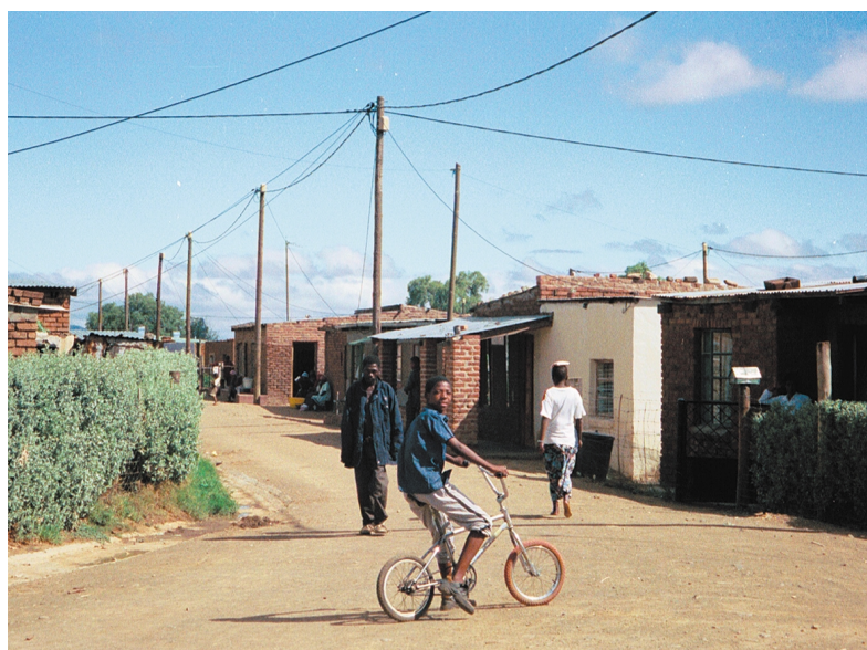
Figure 1: Street scene, eastern Cape, South Africa

Associations between intimate partner violence and situations in which husbands have lower status or fewer resources than their wives 25,36,37 may also be substantially mediated through ideas of successful manhood and crises of male identity. The salient forms of inequality vary between settings. For example, in North America differences in education and occupational prestige convey risk, 25,38 whereas in India employment differences are more important. 9