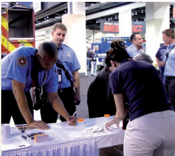
MHN providing free bladder cancer screenings for Firefighters.