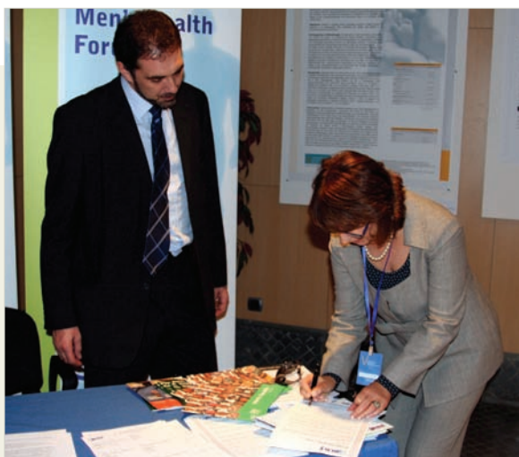
Portuguese High Commissioner for health signs the Declaration

This was followed by the Commission's "roadmap" for equality between women and men recognising the gender dimension in health [COM(2006) 192] and in October 2007, by a new overarching health strategy, Together for Health – A Strategic Approach for the EU 2008-2013 5 in which the reduction of health inequities is mentioned as a main priority including through targeted health promotion, and best practice exchange. In particular, mainstreaming of gender issues in relation to health policy is to be undertaken with the aim of reducing health inequities related to gender, and the quality and comparability of gender specific health data is to be improved.