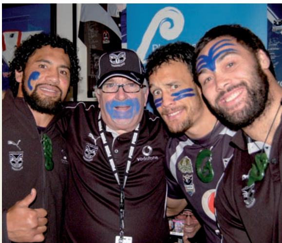
The Warriors "go blue" for Prostate Cancer

Based on data from 2005–2007, life expectancy at birth was 78.1 years for males and 82.2 years for females in Aotearoa/New Zealand. Since the mid-1980s, gains in life expectancy have been greater for males (an increase of 7.0 years) than for females (an increase of 5.1 years), resulting in narrowing of the gender gap 3 .