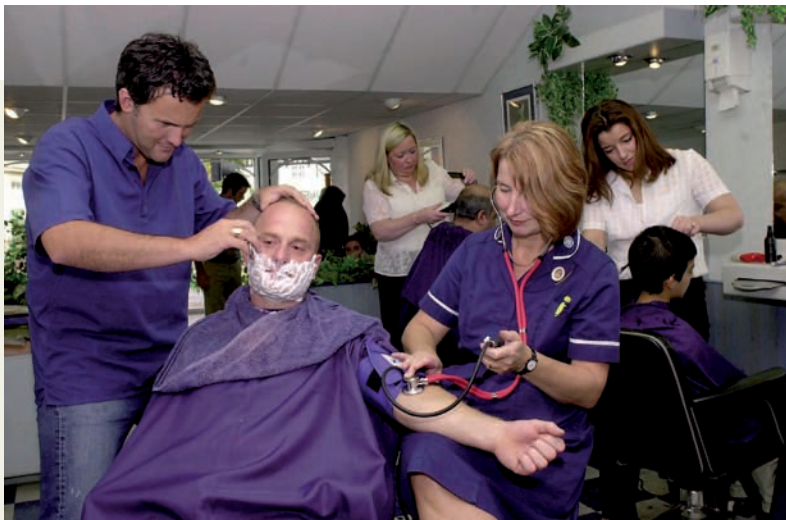
Health check and shave!

The fact that the interest in better male health has developed in this way has had both advantages and disadvantages. The MHF has always believed that the best way to address the health needs of men is to position the issue where it properly belongs – within the debate about gender equalities. This ensures that there is common ground with women's organisations, enables consideration of overlapping equality issues, and provides a strong platform for the political argument. This approach – as we shall see later – has been crucial to the significant progress in the past two or three years in particular. An essay explaining why the differences in health status between men and women (whether to the disadvantage of either sex) should properly be regarded as a health inequality forms the introduction to a report published by the Department of Health in England in 2008 1 .