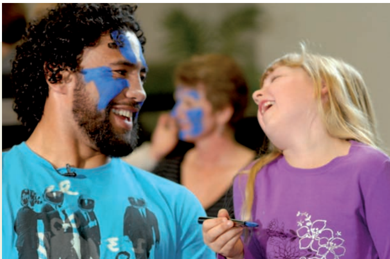
Ruben Wiki 'painting it Blue' in Blue September

The only specific pieces of information we could find on men's health policy in Aotearoa/New Zealand from government ministries were the Men's Health website 14 and a document from the Ministry of Youth Development that focuses on strengths-based approaches to working with young men 15 . These are outlined below.