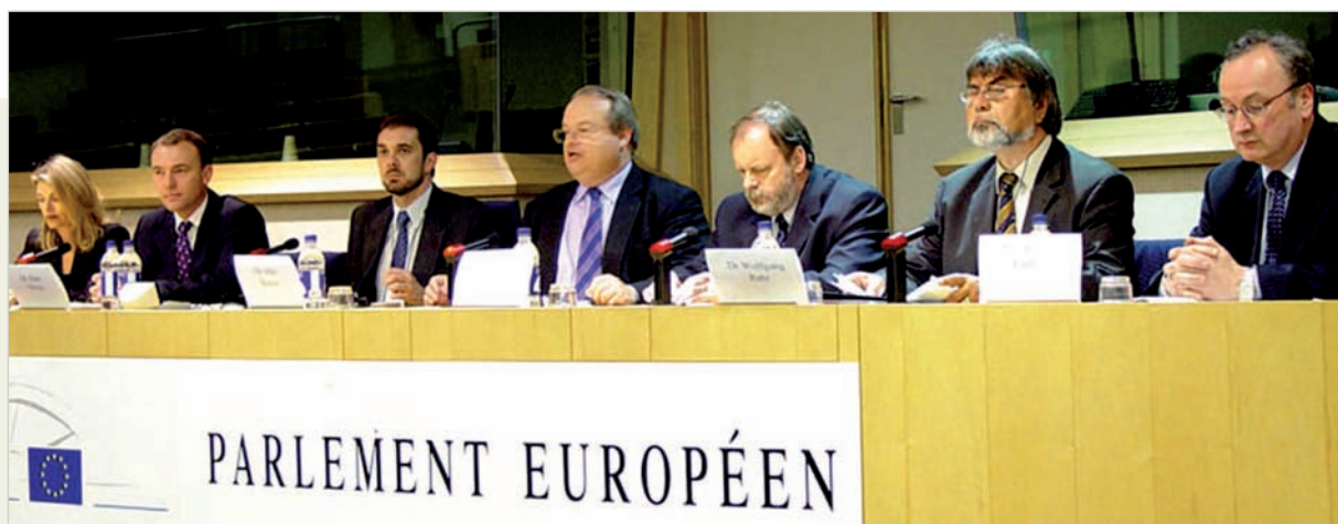
Launch of the first European report on men's health by EMHF

EMHF will pursue its efforts to promote the Vienna Declaration and to advocate for men's health as an area for public health concern. The forum aims progress this issue through debate with stakeholder groups, contributions to EU consultations and participation in relevant EU working groups. Long overlooked, men's health now deserves our full attention.