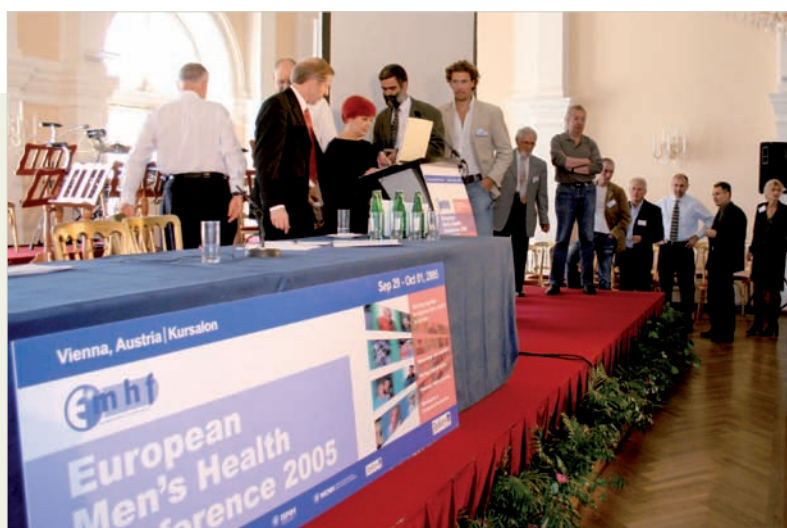
Conference delegates signing the Vienna Declaration

The Commission funds the development of activities on drug treatment, prevention, treatment and harm reduction services and on drugs and prisons as foreseen by the EU Drugs Strategy 2005-2012. The second Public Health Programme (2008-2013) supports actions on drug prevention in the strand "Promoting Health". The majority of actions in this area tend to cater to men. A major 2008 European status report 13 refers largely to gender-specific treatment and facilities to mean women, and particularly pregnant women.