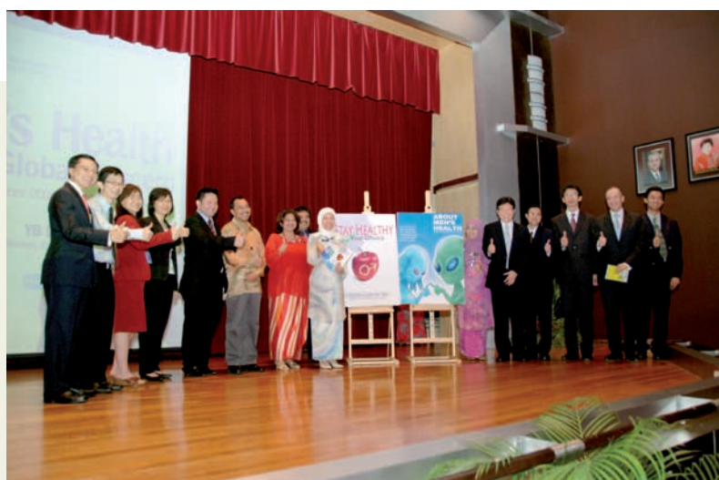
Launch of a Men's health book during a Men's Health Symposium jointly organised by MSASAM and National Population and Family Development Board.

Women's view on what constitutes healthy men, healthy life-styles and men's challenges in keeping healthy were similar to men. Women thought some men were truly concerned about health while others could not care less. Women played a major role in their spouses' health but some men were more readily influenced by their peers.