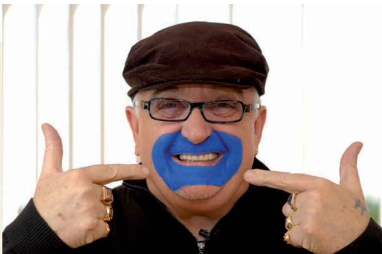
The Mad Butcher faces up to Prostate Cancer

One possible factor underlying the lack of specific policy development for men's health in Aotearoa/New Zealand is that the observed gender inequalities in health may have not been considered to be inequitable. That is, while differences between men's and women's health have been extensively documented, they are not seen as being unfair. They have become normalised and are therefore not perceived as requiring specific intervention 13 .