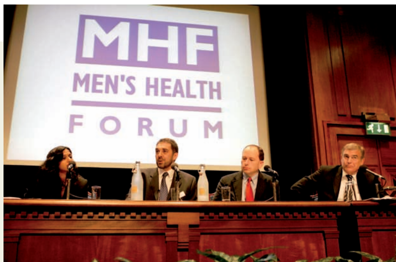
A panel of speakers discusses obesity in men at a national conference in London.

Although men make up (almost) half the population and are not therefore the kind of "minority" group that we normally associate with needing "particular attention", there is no doubt that this clearly identified "social duty" is applicable. Overall therefore, the present situation in for male health England & Wales seems a positive one and, with good management and a little bit of luck, promises to remain so for the foreseeable future.