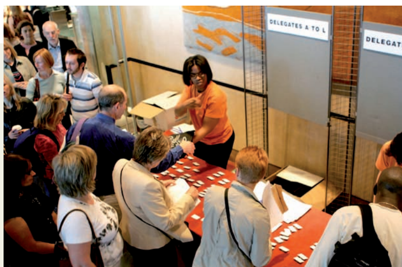
Delegates arrive at a national conference in London to discuss male obesity.

commissioned the MHF to undertake a review of the key issues in men's mental health. Furthermore the Department of Health's own guidance to the Equality Act 6 includes a strong emphasis on men's health needs and behaviours. The important Department of Health report on gender differences in the use of primary care services was mentioned earlier in this chapter.