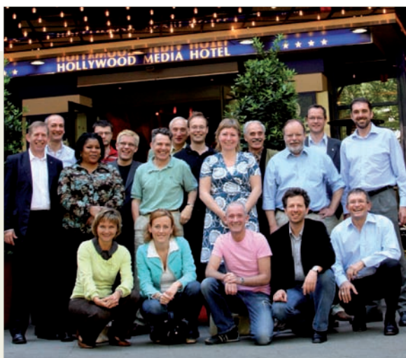
European Network meeting

In many Western European countries mortality differences between socio-economic groups widened during the last three decades of the 20th century. This is, at least partially, explained by a faster mortality decline in higher socio-economic groups who seem to have most benefited from improvements in cardiovascular disease prevention and treatment.