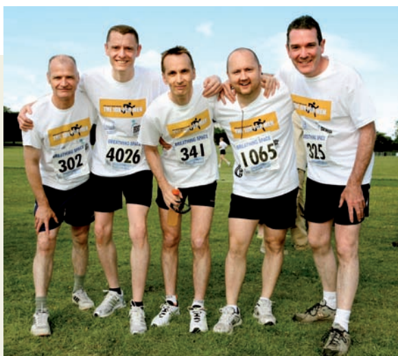
2008 Men's Health Week: Participants to the annual 10km run.

There are real opportunities in relation to policy development; our challenge is in maximising the impact these have on the lives of men in Scotland and ultimately on Scotland as a nation.