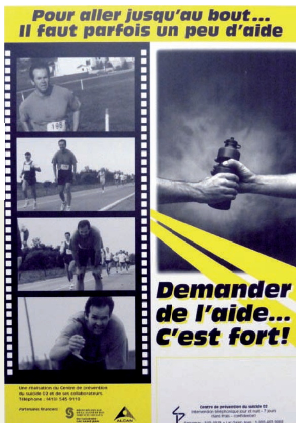
"You have to be strong to ask for help" a poster to help prevent suicide.

In Canada, as elsewhere, efforts to increase awareness and access to men's health services has lacked the focused direction and momentum found in the women's health movement in the 1970s and 1980s. Approaches to address men's health have therefore tended to develop as an adjunct to wider gender initiatives that originally had the health of women as the main focus, or in a piecemeal way where enthusiastic individuals in practice and policy settings have driven the issue forward. Furthermore, the development of male specific health policies remains controversial and efforts must be undertaken to ensure that campaigns for men's and women's health are not drawn into a competing victims discourse with one another as they lobby for limited monies from health care budgets 23 .