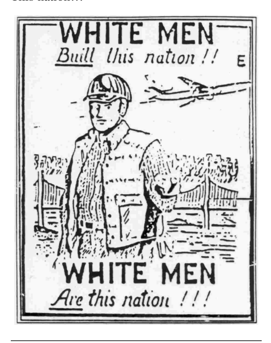
Illustration 24.1 W.A.R. Cartoon

stands proudly before a suspension bridge while a jet plane soars overhead. "White Men Built This nation!!" reads the text. "White Men Are This nation!!!"