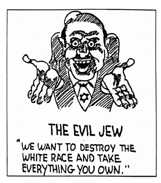
Illustration 24.2 Racial Loyalty Cartoon SOURCE: Racial Loyalty , 71 (June 1991). Copyright © 1991 by Racial Loyalty .

In white supremacist ideology, the Jew is the archetypal villain, both hypermasculine—greedy, omnivorous, sexually predatory, capable of the destruction of the Aryan way of life—and hypomasculine, small, effete, homosexual, pernicious, weasely. A cartoon in Racial Loyalty from 1991 illustrates this simultaneous position.