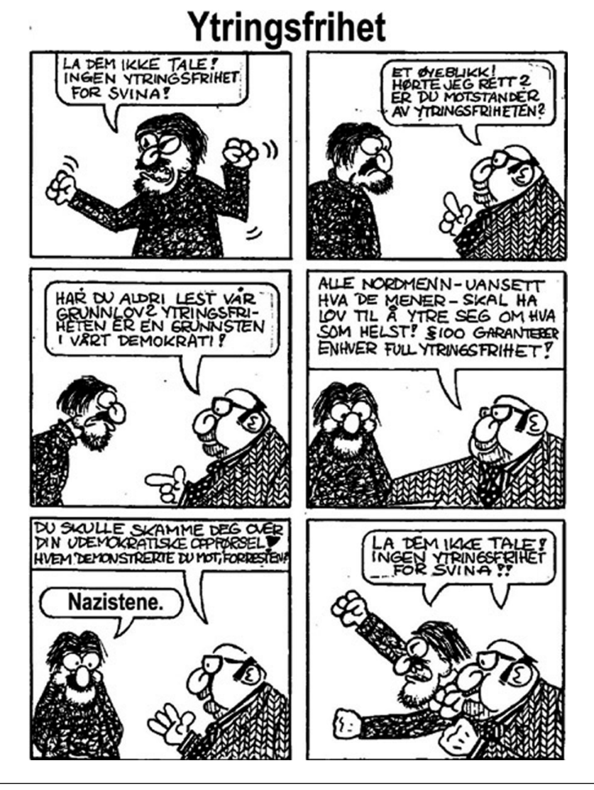
Illustration 24.4 Vigrid Cartoon

masculinity"—a combination of stereotypical male norms with often rather untraditional attitudes that include respecting women. All these Nordic groups experience significant support from young women because the males campaign on issues that are of significance to them; that is, they campaign against prostitution, abortion, and pornography because these are seen as degrading to women (see Durham, 1997). On the other hand, many of these same women soon become disaffected when they feel mistreated by their brethren, "unjustly subordinated" by them, or just seen