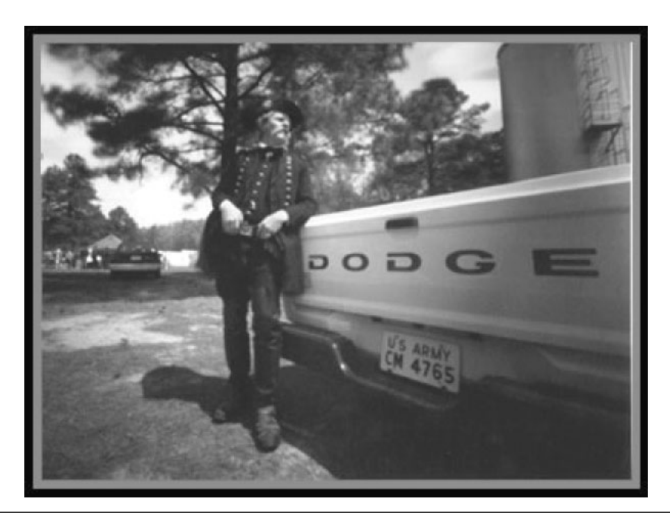
Figure 23.1 Custer's Last Dodge