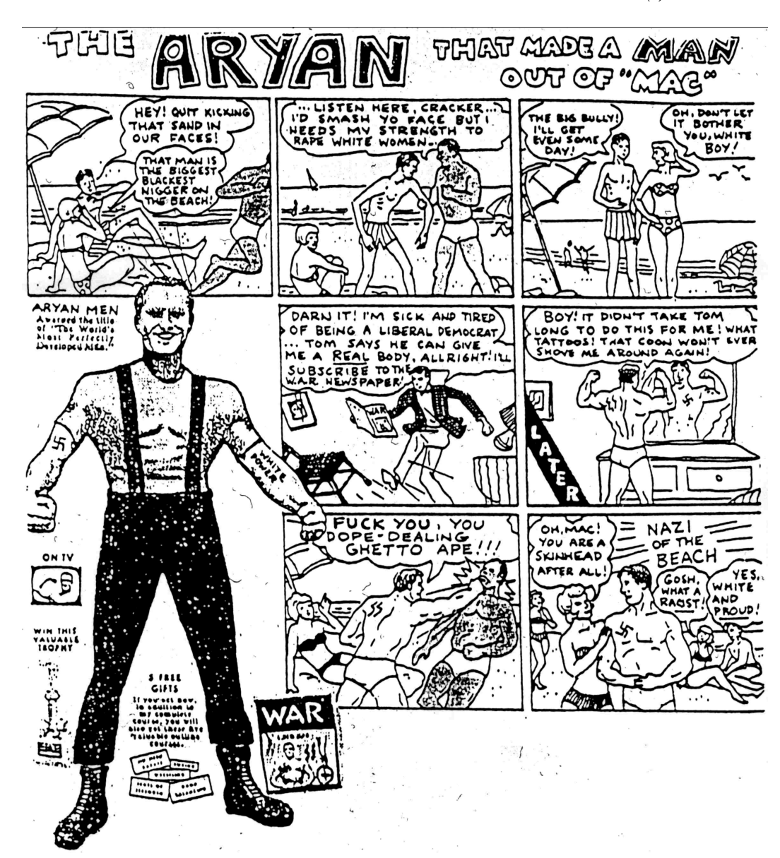
Illustration 24.3 W.A.R. Cartoon