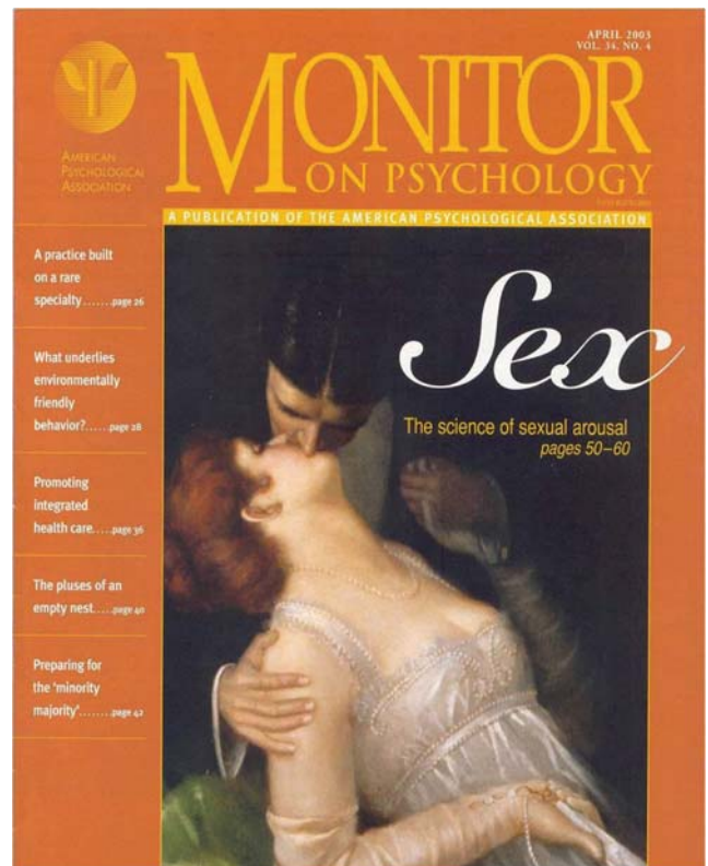
Figure 1. April 2003 American Psychological Association Monitor on Psychology cover (color figure available online).

One decade of literature on backlash effects offers what is likely an important part of the reason (Rudman & Glick, 2008). Backlash is defined as penalties for counterstereotypical behavior (Phelan & Rudman, 2010; Rudman & Fairchild, 2004). During childhood, boys and girls receive a great deal of pressure from parents, peers, and other role models to adhere to gender norms (e.g., Egan & Perry, 2001). As adults, men and