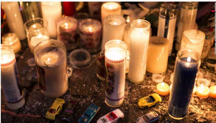
After the Newtown tragedy, sociologist Michael Kimmel asks what drives angry young men to mass murder.