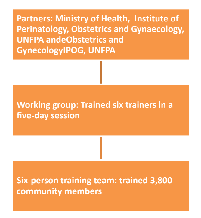
FIGURE 4. THE PROJECT STRUCTURE