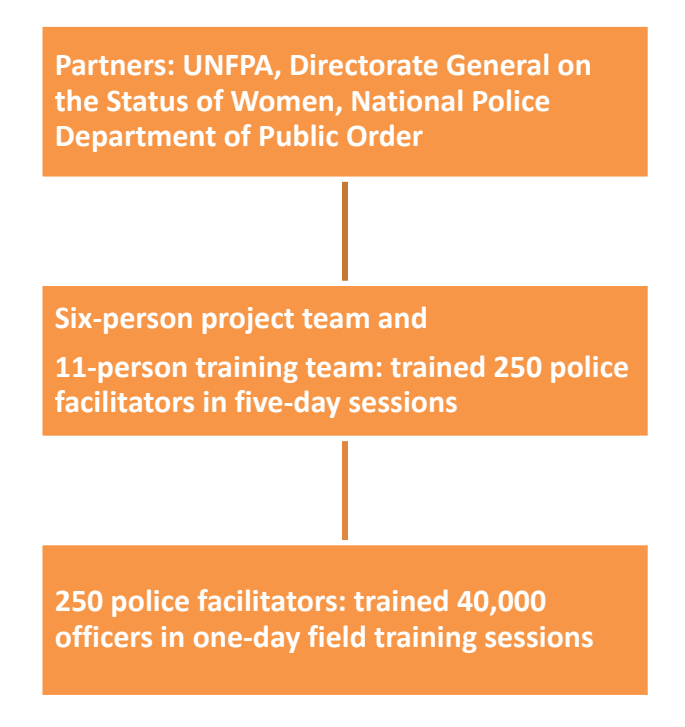
FIGURE 1. THE PROJECT STRUCTURE

Each city has produced a Local Equality Action Plan on gender equality and has established a gender unit within the municipality that is responsible for monitoring progress and commitments. These projects have led to an increase in budget allocations for initiatives on gender equality and better coordination among local institutions and NGOs.