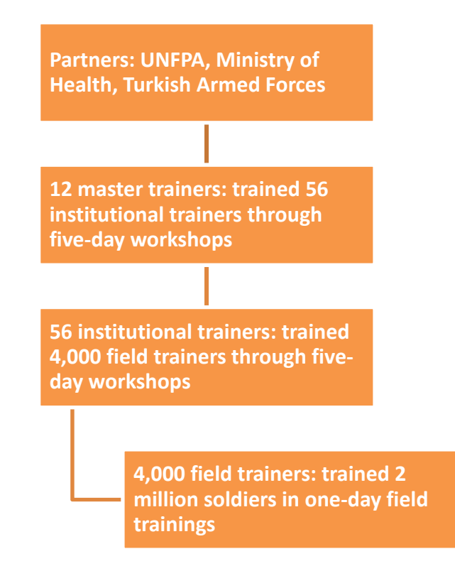
FIGURE 2. THE PROJECT STRUCTURE